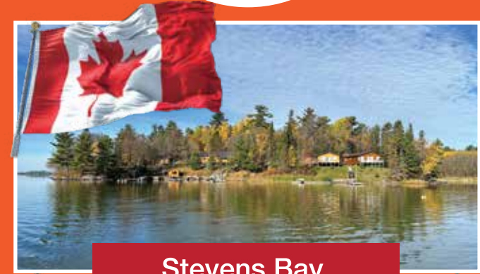
Stevens Bay, Lake of the Woods

www.youngswildernesscamp.com 1-807-484-2930 info@youngswildernesscamp.com